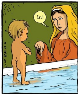
Young Jesus at Bath Time

Gen 3, Gen 8:15-9:7, Gen 12:1-9, 2 Sam 7:1-17, Jer 31.